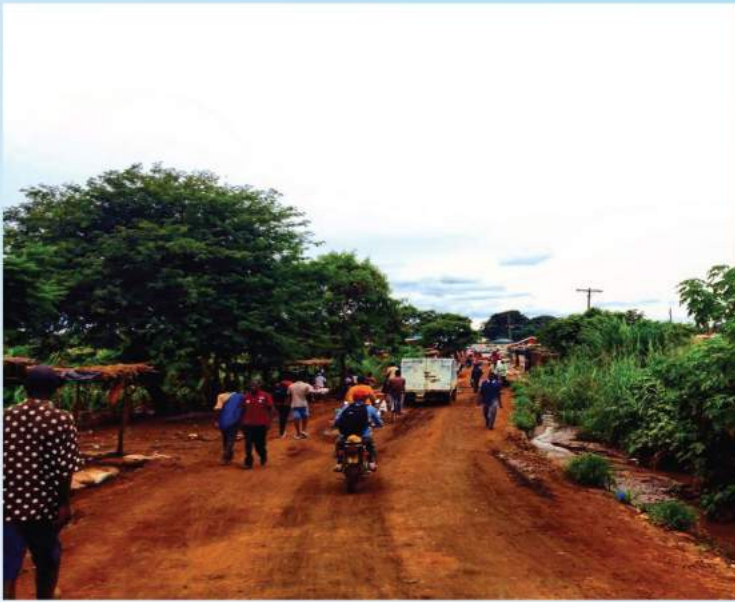
Lilongwe is the largest city in Malawi with a population 646,750 people.