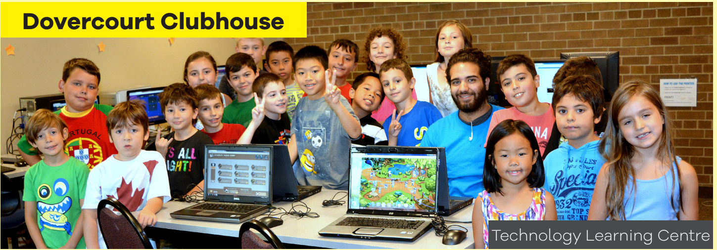
Technology Learning Centre