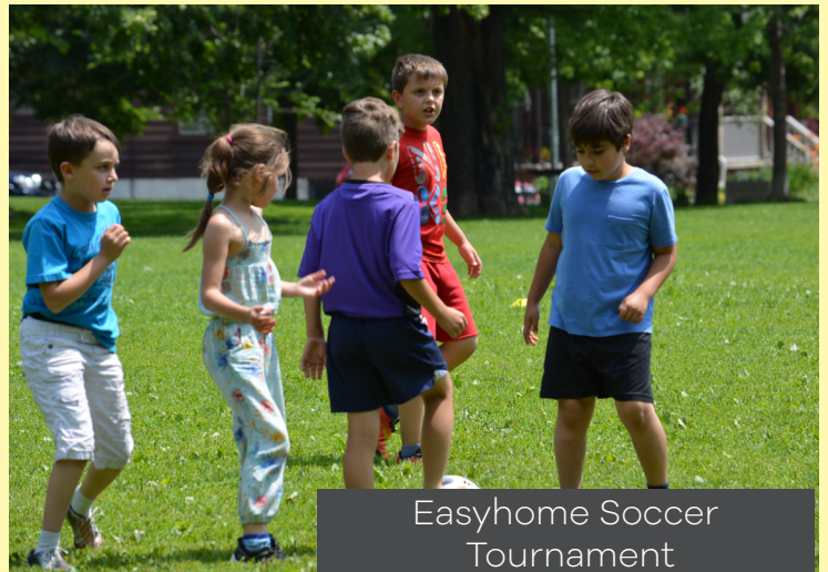
Easyhome Soccer Tournament