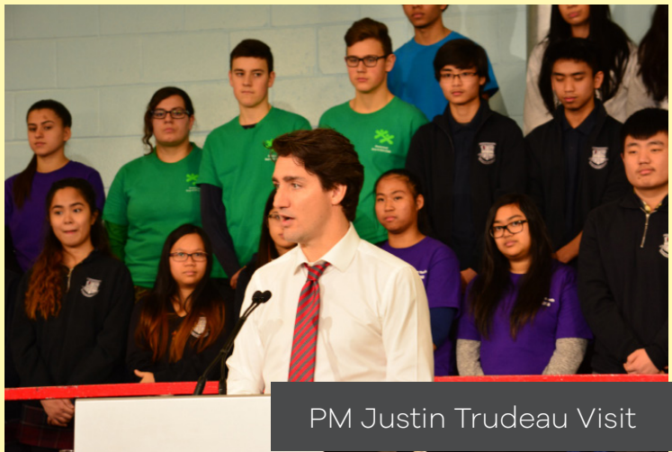
PM Justin Trudeau Visit