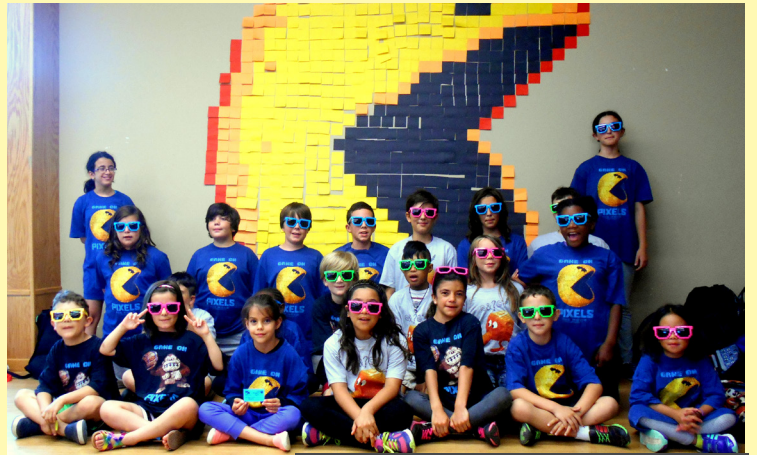
Sony Pixel Quest Event