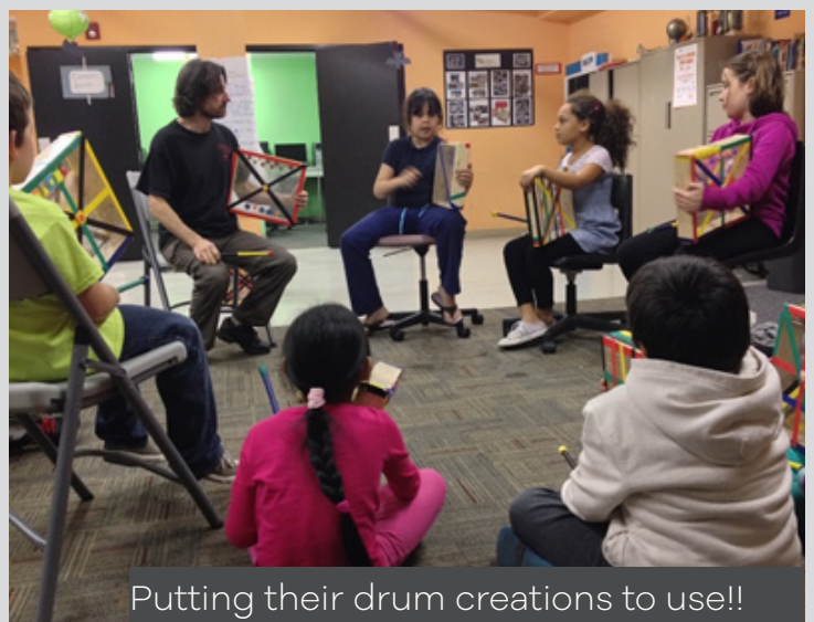
Putting their drum creations to use!!