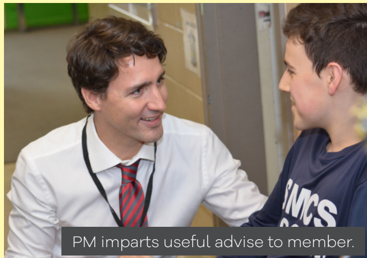
PM imparts useful advise to member.