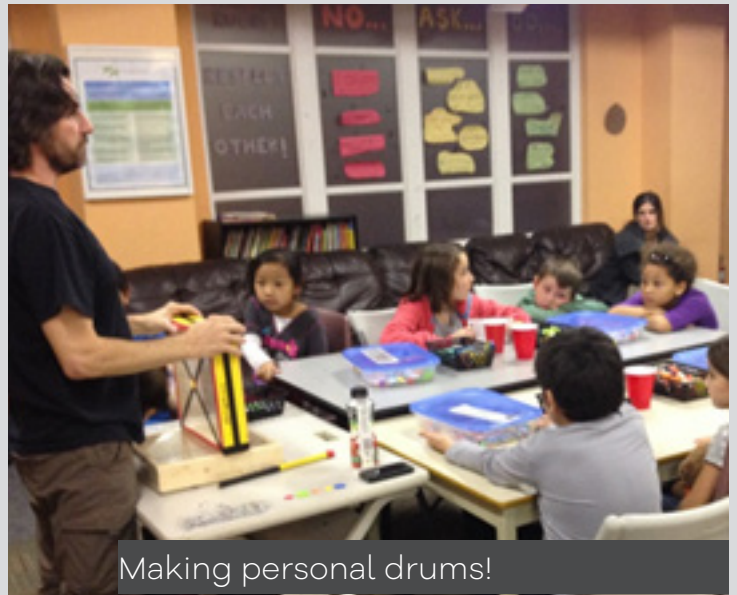
Making personal drums!