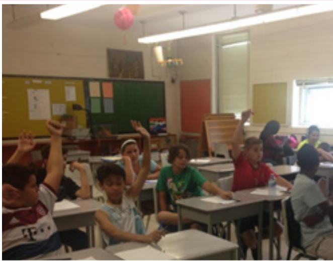
Who has the right answer?.