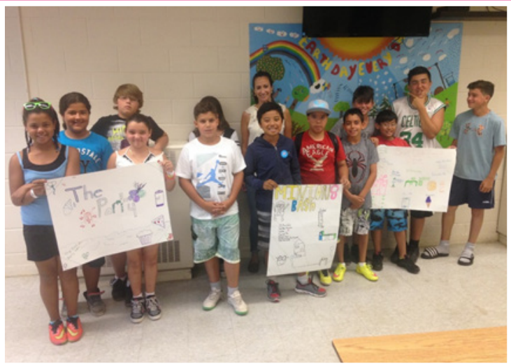
Which party would you attend?