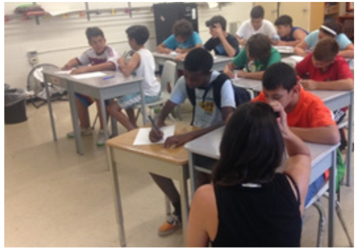
JTC had Summer Day campers participate in Financial Literacy Classes.