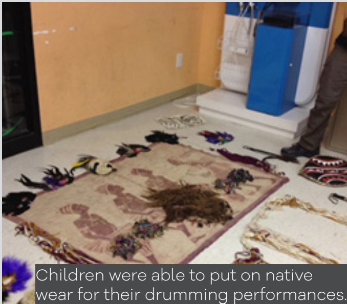
Children were able to put on native wear for their drumming performances.