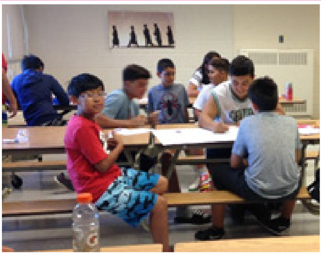
Members need to plan a party on a tight budget!