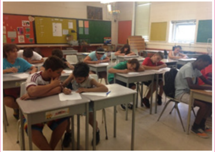
Members hard at work!