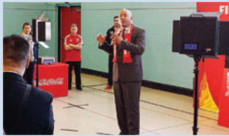
Hon. Michael Coteau giving opening remarks

On Thursday, April 30, 2015, the Dovercourt Boys and Girls Club hosted the Unveiling of the FIFA Women's World Cup by Coca-Cola. In attendance was Hon. Michael Coteau (MPP Don Valley East, Minister of Tourism: Culture