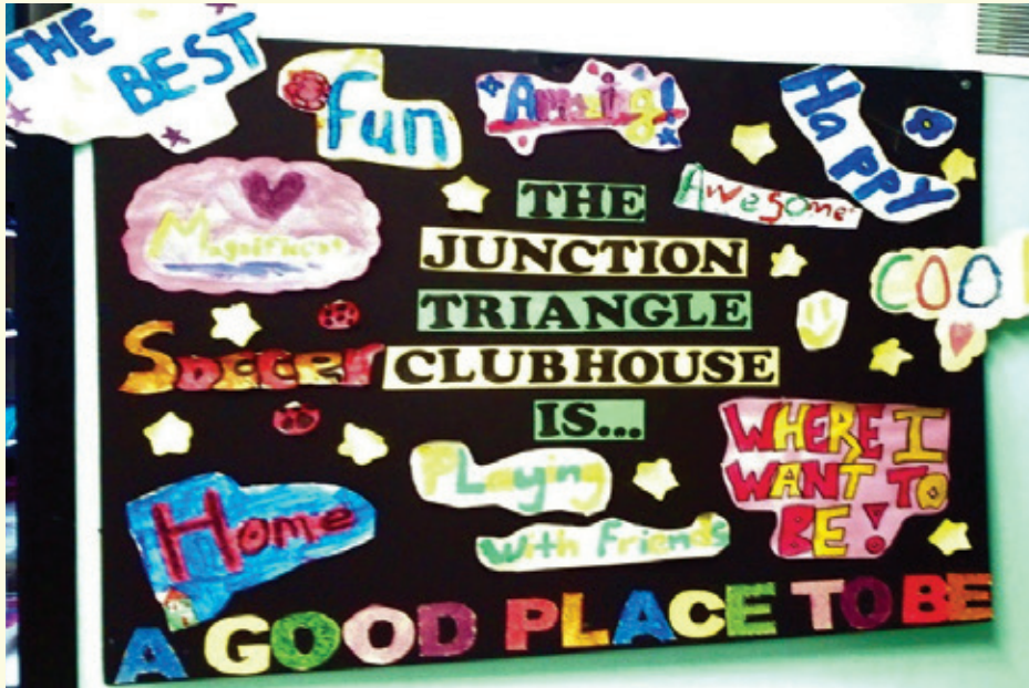
MOST POPULAR ANSWERS ©